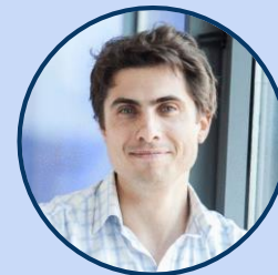
Petr Šmíd Google